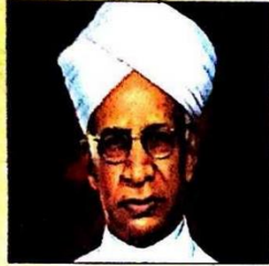
Dr. Sarvepalli Radha Krishnan